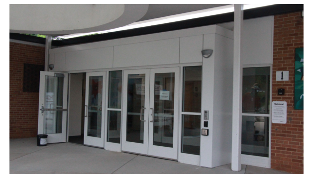
Secure entrances were built at Crestwood, Long and Sperrung this summer.